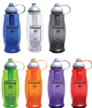
Comes with insert card