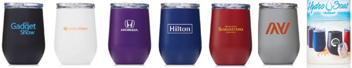
*Full Colour Cylinder Box