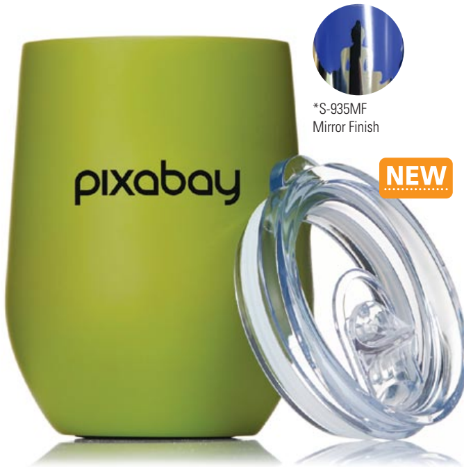
*S-935MF Mirror Finish