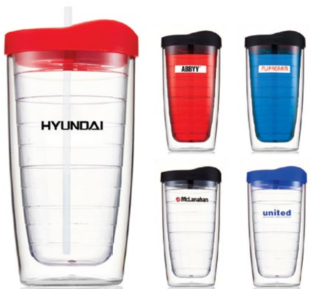
*Shown with free bonus straw